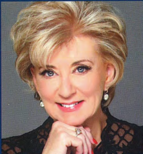
Linda McMahon CEO Women's Leadership LIVE

THE QUARTERLY PUBLICATION BY CEOS FOR CEOS