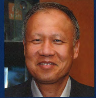
Ken Xie Founder, Chairman & CEO Fortinet